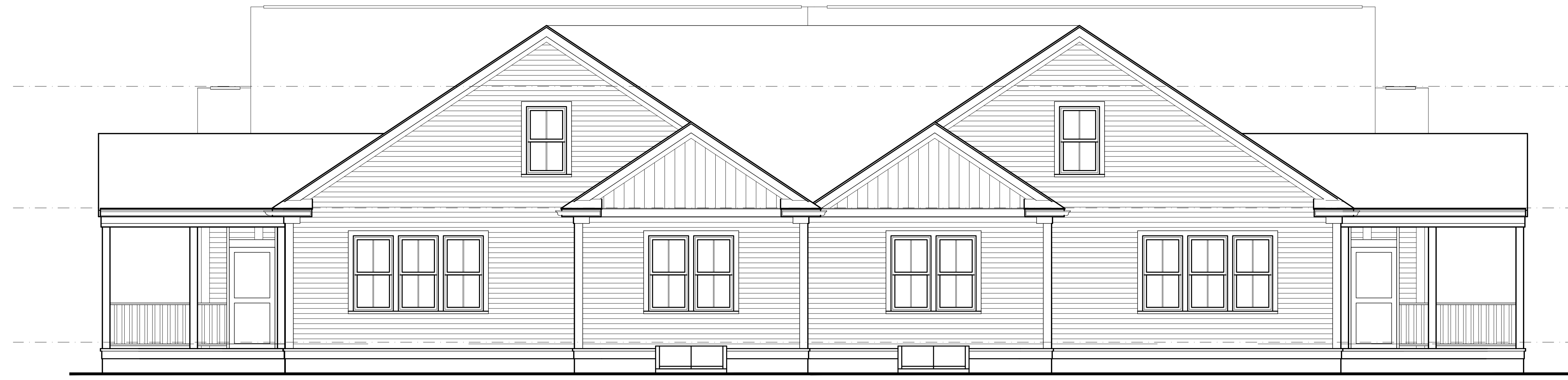
(A) Rear Elevation W/Screen Porch - "G Units" SCALE 1/4" = 1'-0" GREENWOOD MODEL

45 Powhattan Drive East Taunton, MA 02718 (508)341-7692 mbcreates@comcast.net