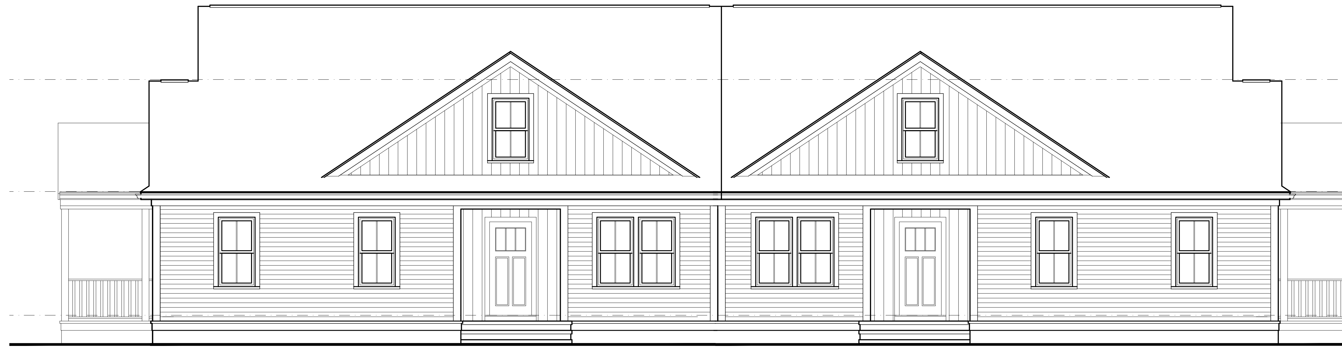
(A) Front Elevation W/Screen Porch - "G Units" 1606 TOTAL SF SCALE 1/4" = 1'-0" GREENWOOD MODEL

45 Powhattan Drive East Taunton, MA 02718 (508)341-7692 mbcreates@comcast.net