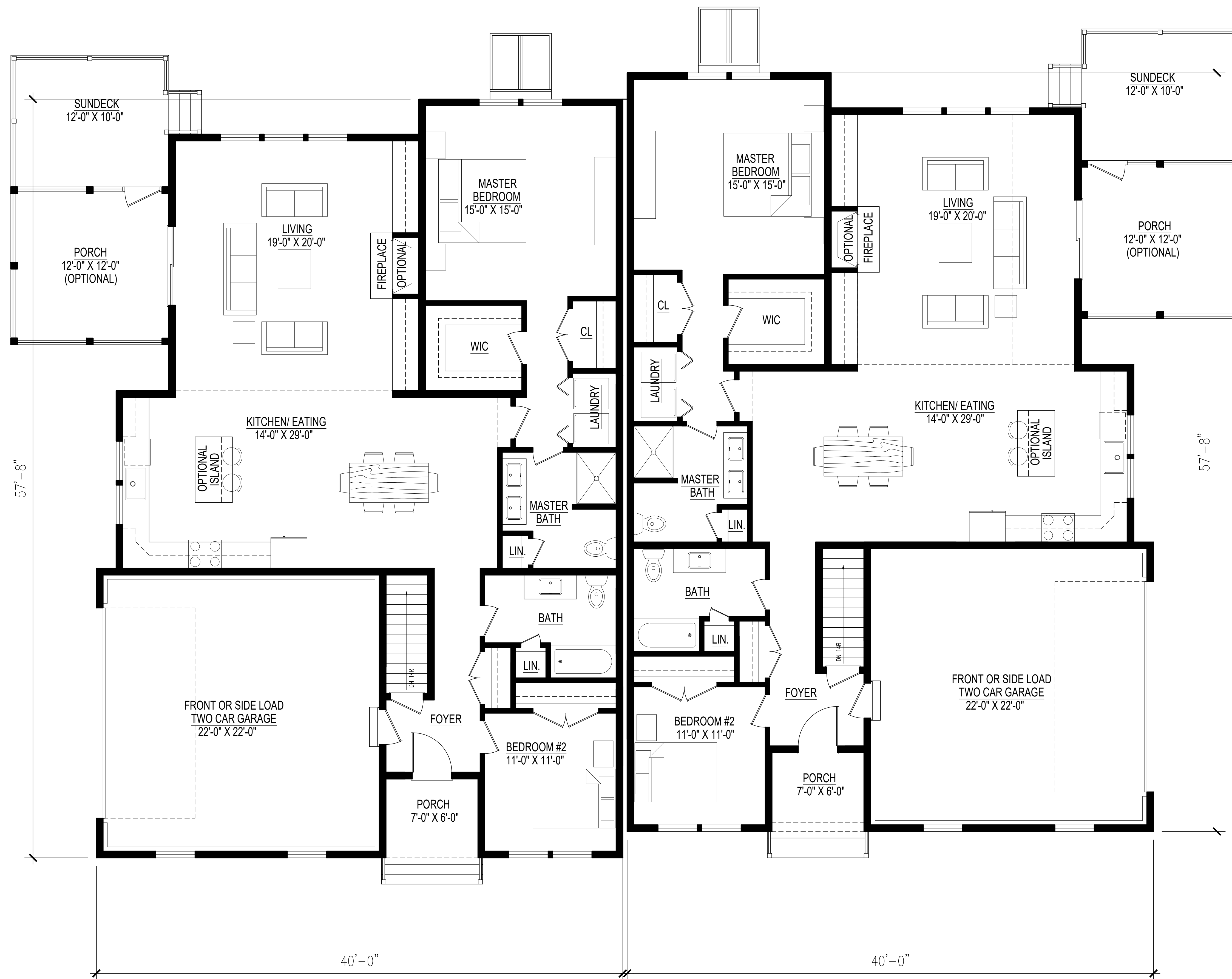
A Proposed First Floor Plan "G Units" w/Screen Porch - 1606 sf/unit GREENWOOD MODEL SCALE 1/4" = 1'-0"

Plans and elevations are solely for illustrative purposes and may not accurately represent the actual condition of a home as constructed and may contain options which are not standard on all designs.