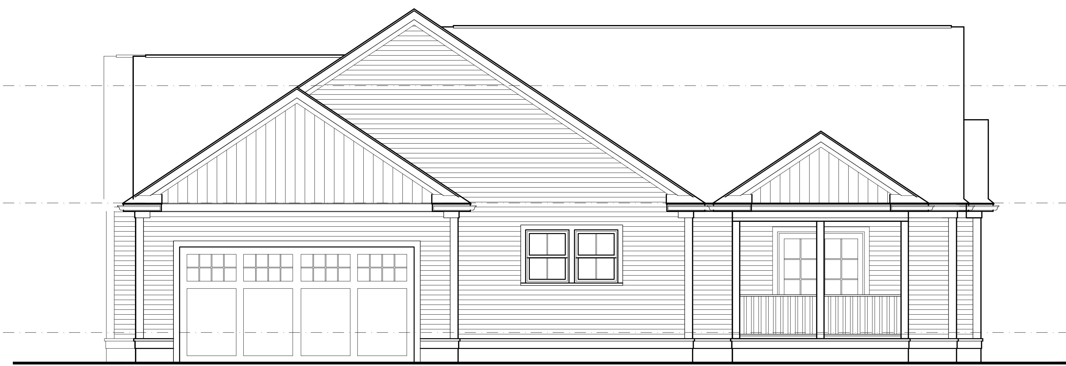
(B) Right Elevation W/Screen Porch - "G Units" SCALE 1/4" = 1'-0" GREENWOOD MODEL

These drawings and specifications were prepared for use at the location indicated hereon. Publication and use is expressly limited to the identified location. Re-use or reproduction by any method, in whole or in part, is prohibited without the written permission of Designer. ©2021