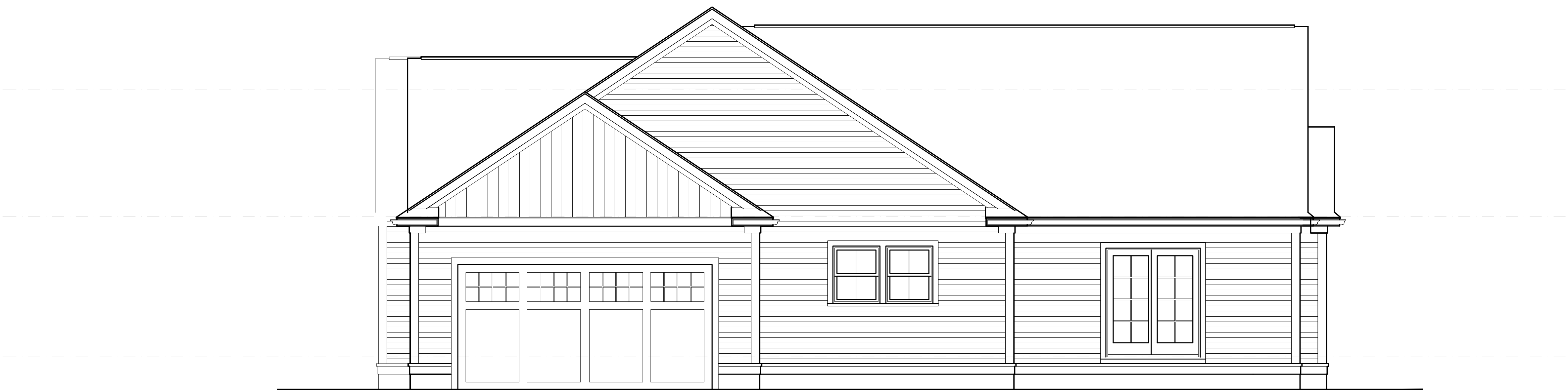
Ⓑ Right Elevation - "G Units" SCALE 1/4" = 1'-0" GREENWOOD MODEL

PROPOSED PLANS FOR: REPURPOSE PROPERTIES VILLAGES AT PLUMB CORNER ROCHESTER, MA